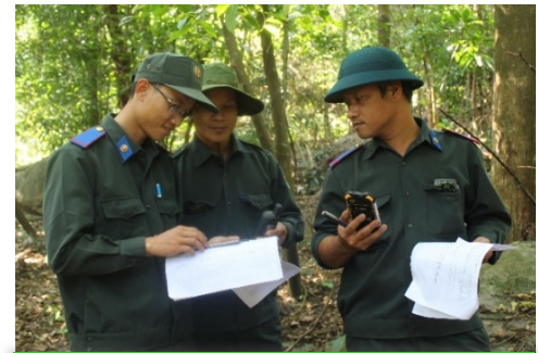
ECODIT worked with provincial government bodies in Vietnam on natural resource management.

The USAID VNGA worked with provincial government bodies in Vietnam to help them better monitor and manage natural resources and enforce environmental laws; supported forest-dependent communities to engage in sustainable alternative livelihoods through a robust grants program; established carbon markets; and facilitated partnerships with the private sector. The project laid the groundwork for Vietnamese governments, communities, and businesses to continue working together to protect Vietnam’s natural resources. Accomplishments included reducing greenhouse gas emissions by over 11.6 million metric tons of carbon dioxide equivalent, boosting incomes for more than 15,000 people, and mobilizing more than $59 million in private sector funding for the environment—nearly triple the Activity’s initial target.