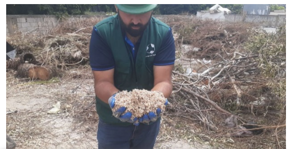
ECODIT is supporting local solutions to effective solid waste management in Lebanon.

The USAID DAWERR Activity is working with municipalities, local communities, and the private sector to implement integrated solid waste management solutions for municipalities and unions of municipalities. The Activity employs innovative co-creation and solution identification approaches, engaging national and local governments, communities, youth, civil society, and the private sector. The results will be improved health and social welfare and expanded economic horizons for the people of Lebanon.